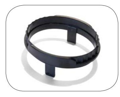
Oval Glove Ring: 60261 2 pcs