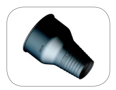
Silicone Wrist Seals: 61025 2 pcs