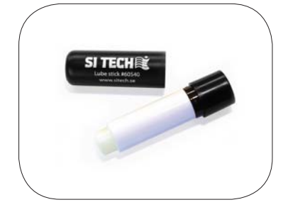
Lube Stick: 60540 2 pcs