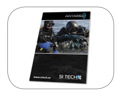
User Manual 1 pcs