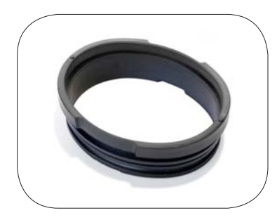
Oval Stiff Ring: 60260 2 pcs