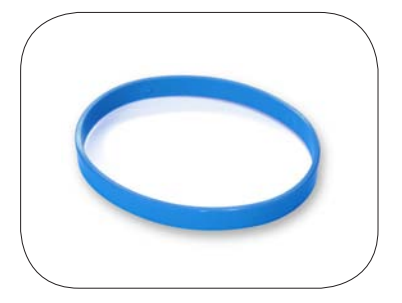
Oval Spanner Ring (blue): 60263 2 pcs