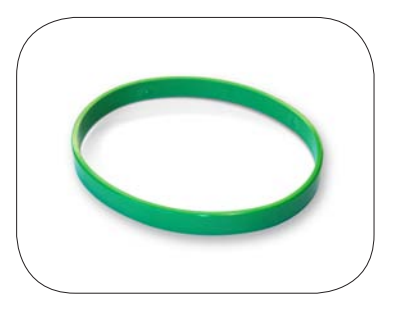
Oval Spanner Ring (green): 60264