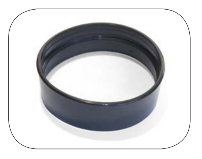
PU- Ring: 60251 2 pcs