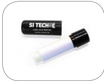
Lube Stick: 60540 2 pcs