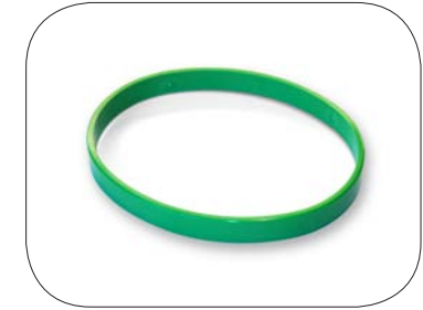
Oval Spanner Ring (green): 60264 2 pcs