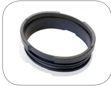
Oval Stiff Ring: 60260 2 pcs