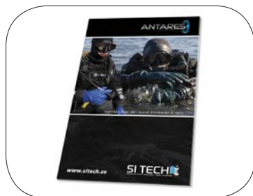
User Manual 1 pcs