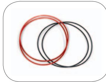
O-rings: - 4 pcs of 1,5 mm, Item no. 80173 (mounted+ spares) - 4 pcs of 1,6 mm, Item no. 82038 (mounted+ spares)