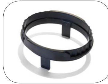
Oval Glove Ring: 60261 2 pcs