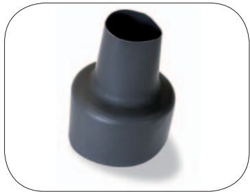
Latex Wrist Seals: 61062 2 pcs