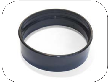
PU- Ring: 60251 2 pcs