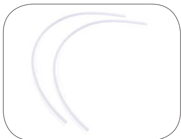
Pressure Equalization Tubes: 60233 2 pcs